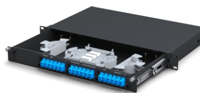
Fiber Splicing Deployment